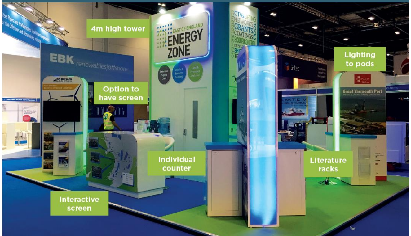
Exhibit at Europe's leading gathering of the entire offshore energy industry. More than 550 exhibitors from around the world present their newest services, projects and innovative products. 12,000 professionals across global markets will visit the exhibition, take part in strategic discussions, immersive technical conference sessions focusing on the future and technical developments in the industry.

8th-9th OCTOBER 2019, AMSTERDAM, STAND 1.230